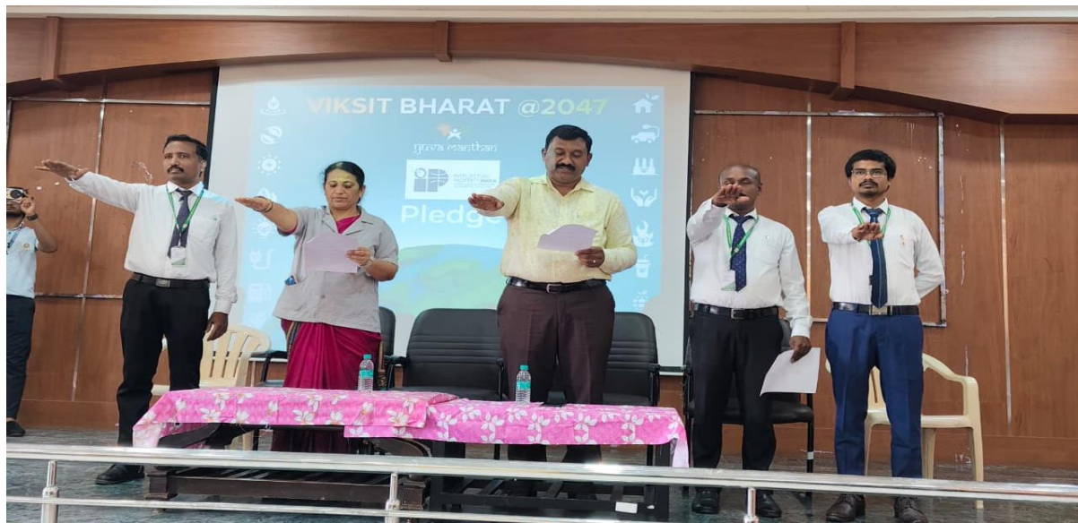
Faculty member takes pledge regarding Viksit Bharat @2047 before commencing the IPR Awareness Programme

On 13 th October 2025, the IPR Committee organized an IPR Awareness Programme under the National Intellectual Property Mission. The programme was designed to enhance the understanding and awareness of Intellectual Property Rights (IPR) among the academic community. It sought to sensitize faculty members and students to the significance of protecting intellectual assets, fostering innovation, and effectively translating research outcomes, particularly in the context of higher education and entrepreneurship.