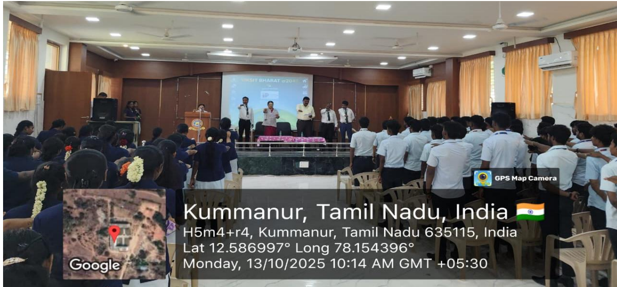
Participating students taking pledge regarding Viksit Bharat @2047 before commencing the IPR Awareness Programme